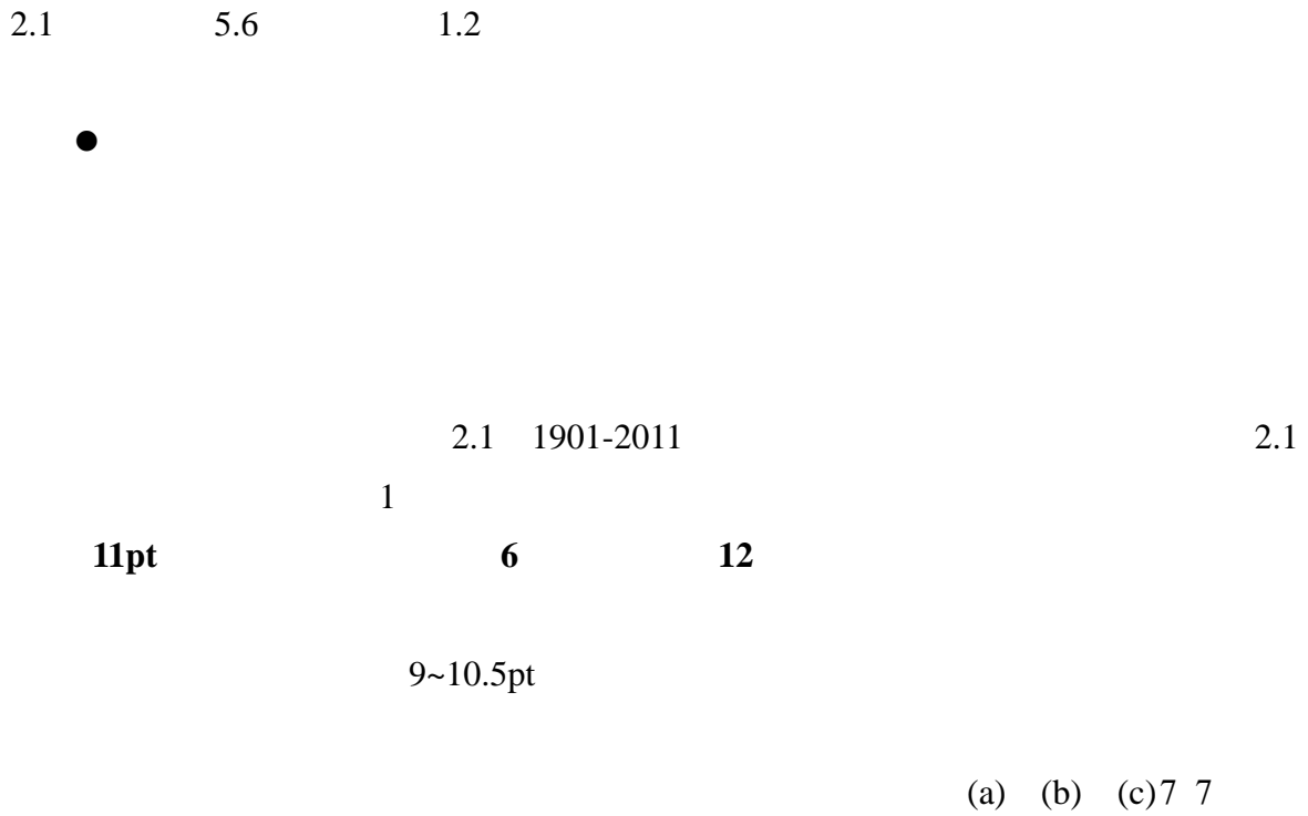
Fig 2.1 Distribution of annual mean temperature Northwest China from 1901 to 2011